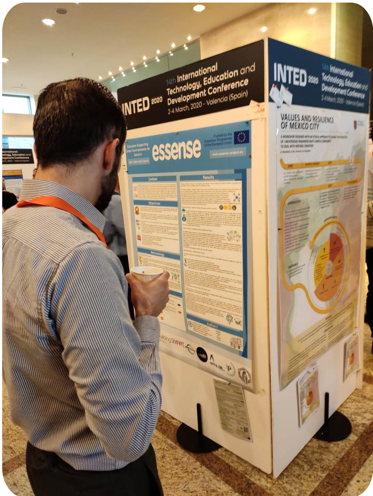
ESSENSE at INTED 2020

ESSENSE Project was presented during the 14th annual International Technology, Education and Development Conference, INTED2020, that was held in Valencia (Spain) on the 2nd, 3rd and 4th of March, 2020. INTED is one of the largest international education conferences for lecturers, researchers, technologists and professionals from the educational sector. After 14 years, it has become a reference event where more than 700 experts from 80 countries will get together to present their projects and share their knowledge