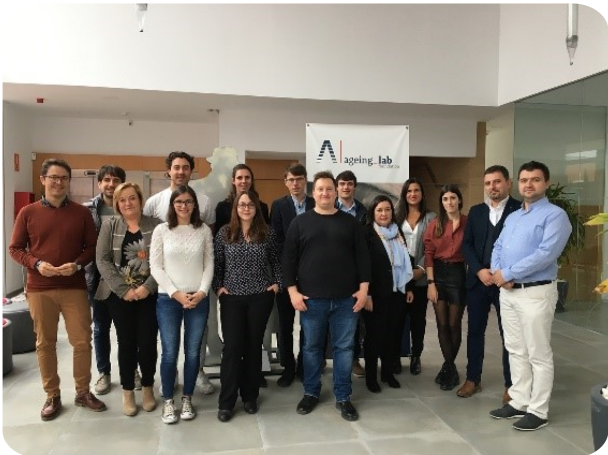
The Team of ESSENCE in Jaen at Ageing Lab Foundation

The Third Transnational Meeting event was hosted by Ageing Lab Foundation, on November 11th & 12th 2019 in Jaen, Spain. Attended by all the entities that encompassing the consortium. The main goal of this meeting was to present the results reached to dates and to establish future details regarding the different actions that will be undertaken by the project partners during the following months.